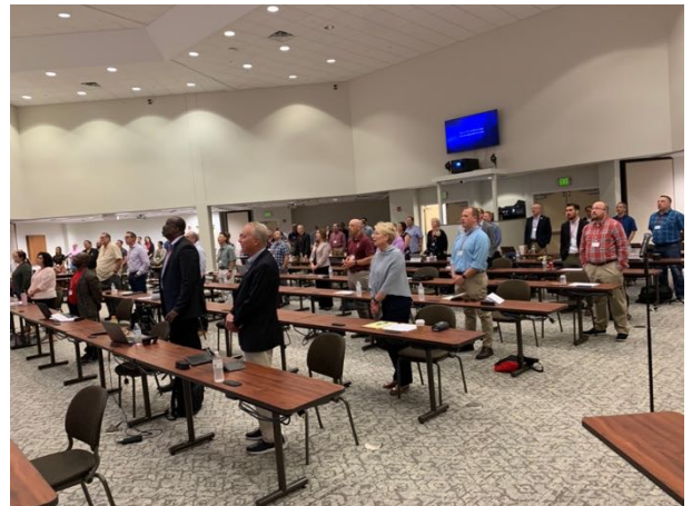
IACE conferees confessing the Nicene Creed together

From its inception, IACE never has sought to supplant or compete with existing alliances or organizations. It seeks instead to complement and partner with those entities whenever possible. At the same time, it maintains a unique focus centred on four key initiatives: