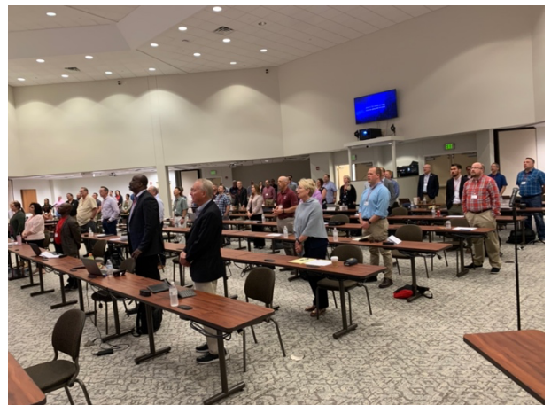
IACE conferees confessing the Nicene Creed together

From its inception, IACE never has sought to supplant or compete with existing alliances or organizations. It seeks instead to complement and partner with those entities whenever possible. At the same time, it maintains a unique focus centred on four key initiatives: